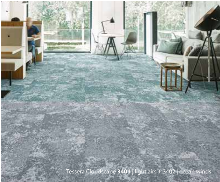
Tessera Cloudscape 3401 | light airs + 3402 | ocean winds