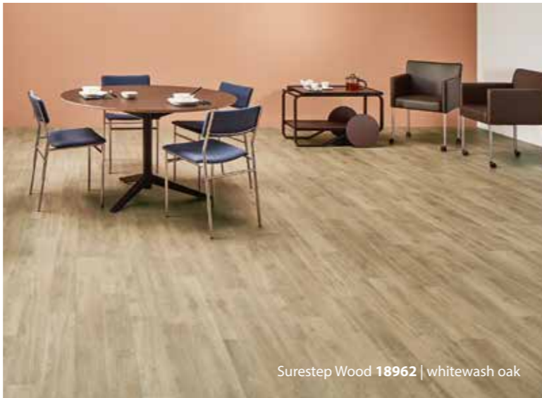
Surestep Wood 18962 | whitewash oak