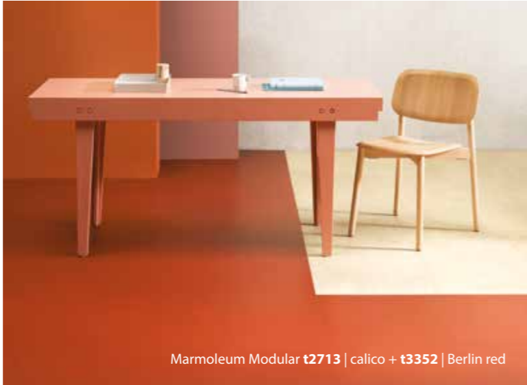
Marmoleum Modular t2713 | calico + t3352 | Berlin red