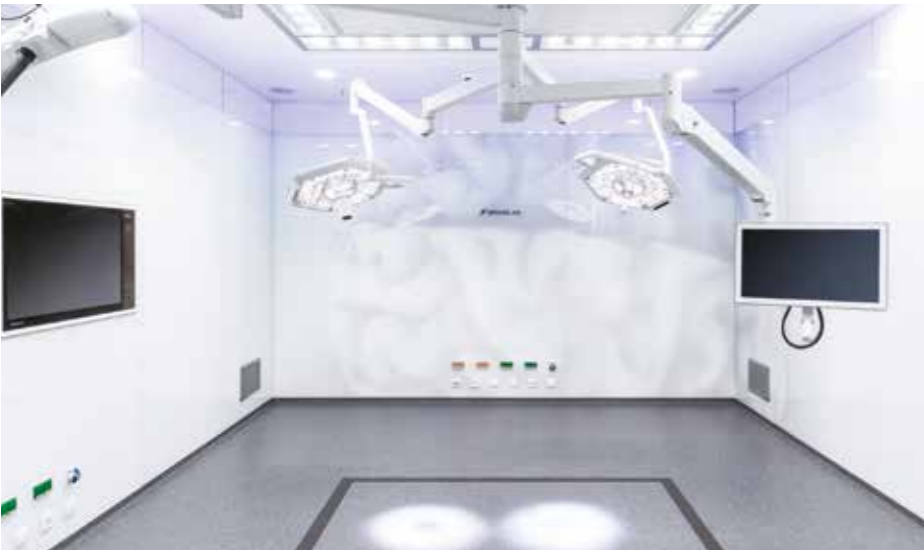
BRAINLAB Munich Product: Colorex, Eternal

The headquarters of Brainlab is located in Munich, Germany. Brainlab is a software-company that specialises in applications for the medical sector. Two colours of Colorex SD flooring have been used in the main areas. In the corridors and reception area Eternal digitally printed vinyl has been installed.