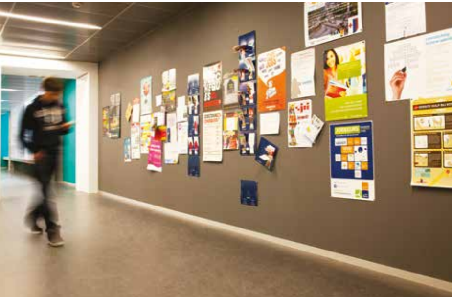
Artevelde Hogeschool Product: Marmoleum Bulletin Board