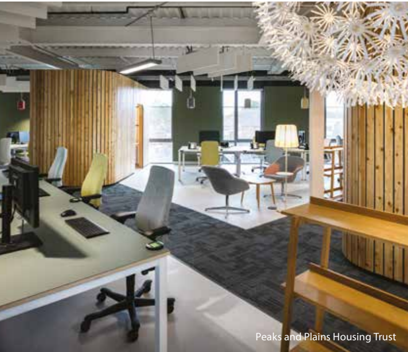
Peaks and Plains Housing Trust

For more information on our floor finishes that work together, please visit www.forbo-flooring.co.uk/government